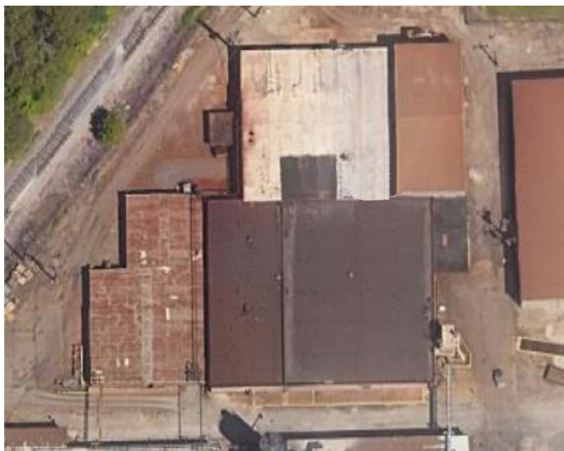
2023 now part of Decatur Foundry